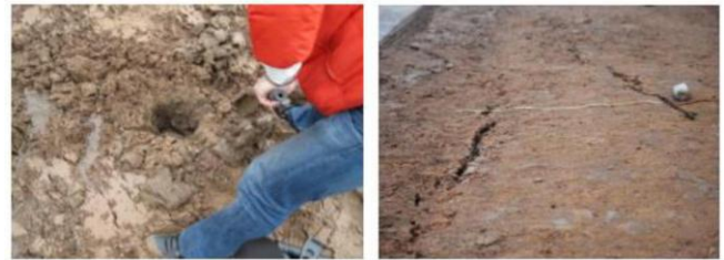
a. red mud produced in Bayer processing. b. red mud produced in Sinter processing