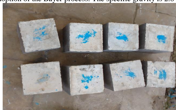
Concrete cube specimens of 150x150x150

A solid- waste generated at the Aluminum plants all over the world .In Western countries; about 35 million tons of red mud is produced yearly. Because of the complex physico-chemical properties of red mud it is very challenging task for the designers to find out the economical utilization and safe disposal of red mud. Disposal of this waste was the first major problem encountered by the alumina industry after the adoption of the Bayer process. The specific gravity is 2.64.