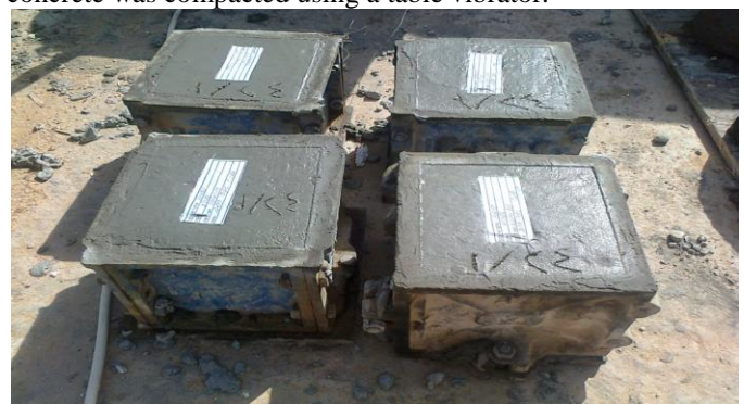
Casting of specimens

Totally 120 cubes (60 for M_{40} +60 for M_{50} ) of size 150 mm x 150 mm x 150 mm and were cast to study the compressive strength of red mud concrete. Standard cast iron moulds were used for casting the test specimens. Before casting, machine oil was smeared on the inner surfaces of moulds. Red mud concrete was mixed using a horizontal pan mixer machine and was poured into the moulds in layers. Each layer of concrete was compacted using a table vibrator.