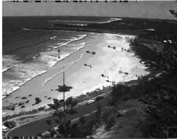
Figure 2. An example of a range of visually discernible shoreline indicator features, Charalsh Beach, New South Wales, Australia. For key, see Figure 1.